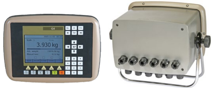
Panel Mount (PM)