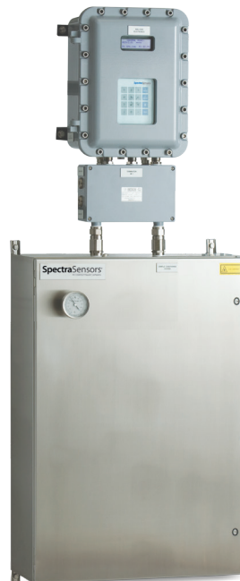
SS2100a with Sample Conditioning System

Reliable Trustworthy measurements are vital in process analytical applications. The TDL sensor is unaffected by contaminants and corrosives since the gas stream never touches the laser or detector. The SS2100a requires little regular maintenance and does not need recalibration or periodic replacement parts due to the inherent stability of TDL technology.