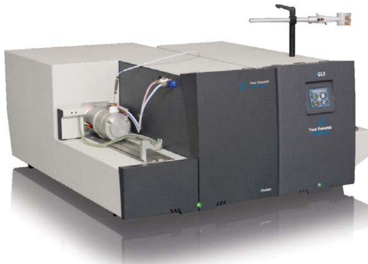
Configuration: XPLORER with GLS*