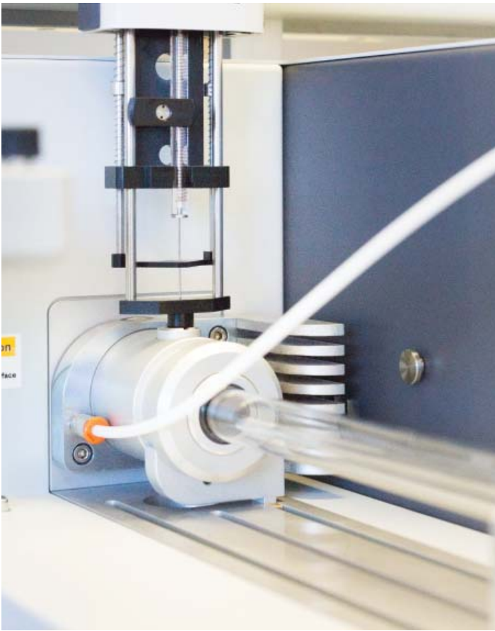
Configuration: XPLORER with ARCHIE*