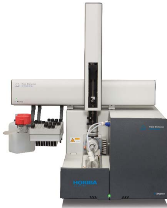
Configuration: XPLORER with ARCHIE*